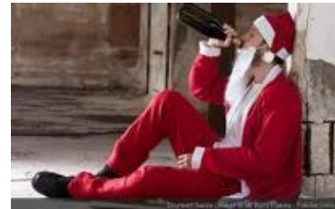
Macy's Santa Claus preparing for work.

The Madhatters left Macy's that evening, full of holiday cheer and smelling much better than when we arrived.