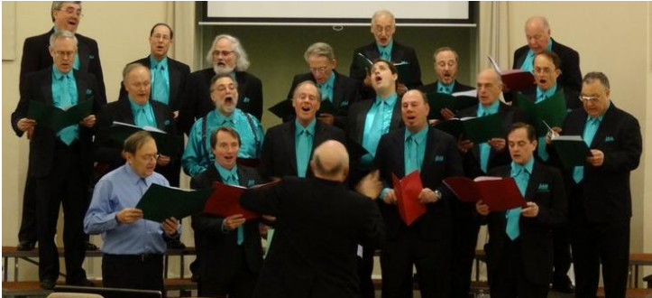
The Mad Hatters warming up before Home for the Holidays.