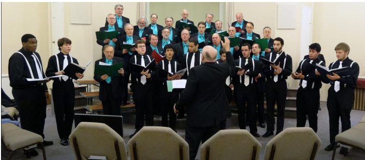
The Mad Hatters and the Parallel Fifths.