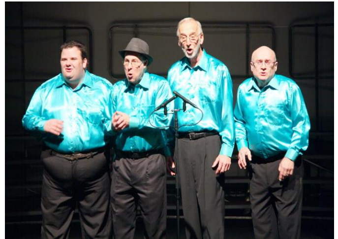
Loco Fedora performs at the Northeast District Convention in Portland, ME. With only one hat the quartet wondered if they are now Loco Fedoras.