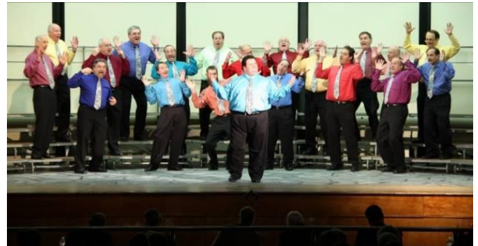
The Mad Hatters performing at the 2011 Yankee Division Chorus Contest

The contests were held April 15 and 16 at Central High School in Colonie, NY. Schenectady, NY, was the host chapter.