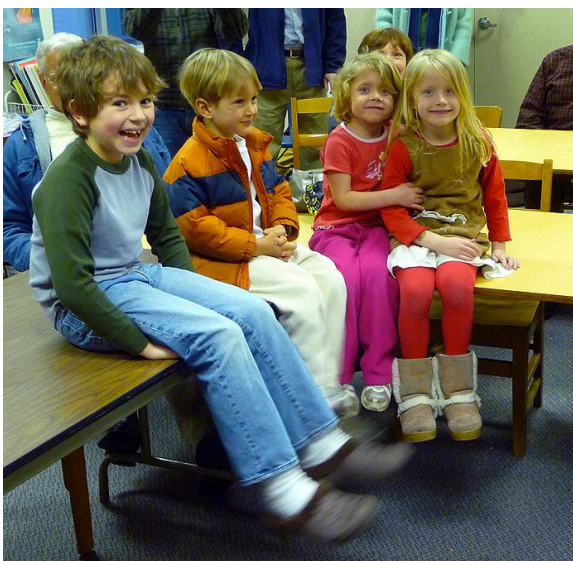
Children in the German Class.

A group of ladies were meeting as part of the fund-raising auction committee and asked us to sing a few valentine songs. They evidently liked our music and asked if we would volunteer to auction off a one hour performance. We felt this would be a great opportunity to support a worthwhile cause, spread Barbershop in the New Milford area and possibly recruit new members and get a few new gigs.